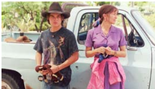
The Fabulous TRANSAMERICA - 9 February 2007