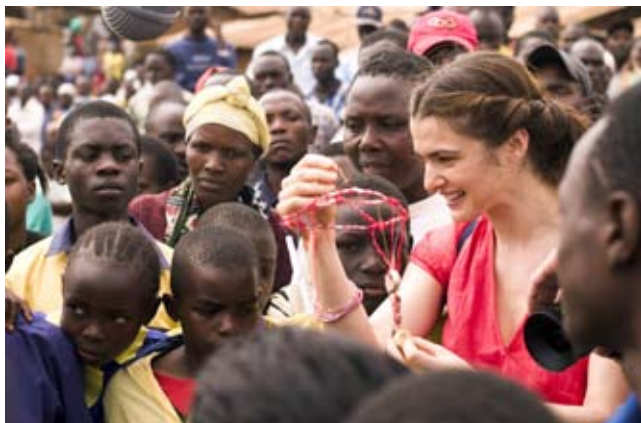
Oscar winner, Rachel Weisz in THE CONSTANT GARDENER - 12 January 2007

When the committee chooses the films for the season they try to put together a selection of different types of film from around the world which will both entertain and educate. There should be something for everyone but especially the type of film which we know you have enjoyed over the past 8 years.